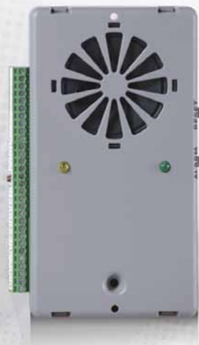
Dimensions: 146 x 92 x 22 mm Weight: 234 g